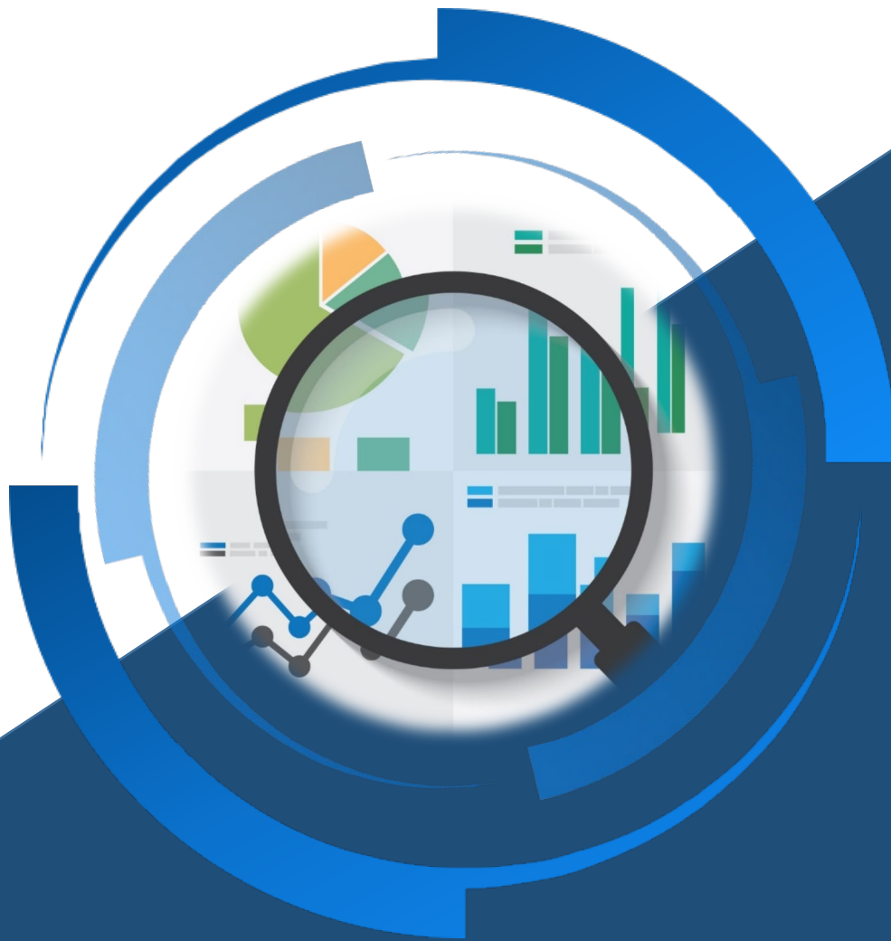
Bild & Co 2023 Market Survey Analysis: Senior Living Occupancy

March 21, 2024 Senior Living Weekly Data Drips